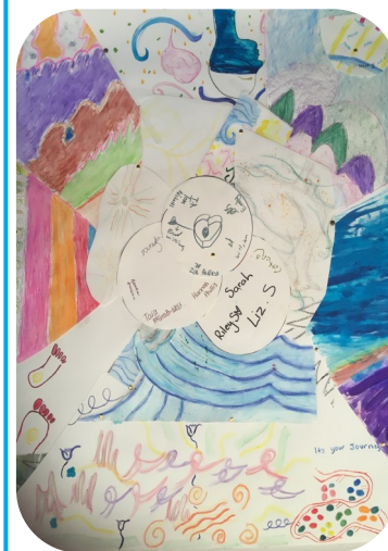
Art from Year 11 Day @ St Clements