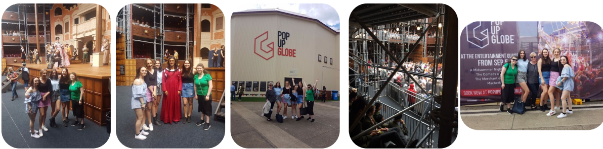
Pictures above of Advanced English Excursion to Sydney.

Students in Stage 5 English have been studying the diversity of relationships, as explored in the novels Eleanor and Park and The Outsiders . Their assessment was to complete a number of tasks in a learning matrix to deepen their understanding of texts. Many students used their creative talents which resulted in completed work, that was to a high standard.