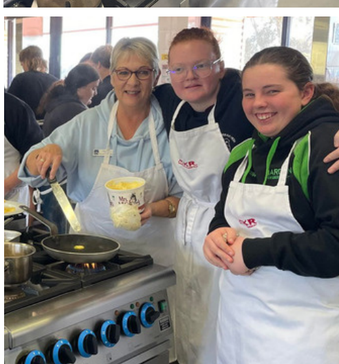
Stage 5 have been busy in the kitchen in the last few weeks.

They have made delicious crepe suzettes which consisted of crepes drizzled in an orange sauce and topped with ice cream. Students had a great time perfecting the crepe flip! They also whipped up a mouthwatering chicken chow mein.