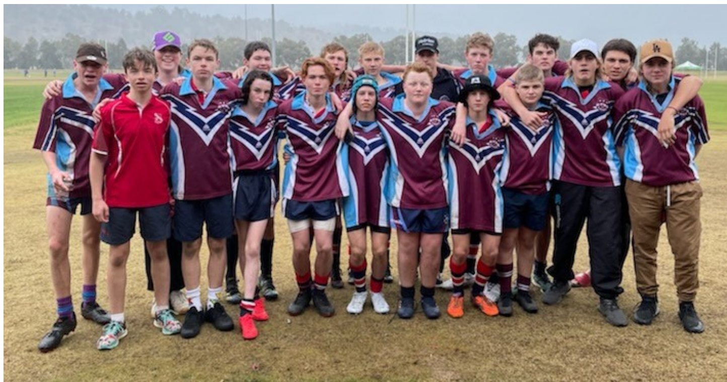
Boys Small Schools Rugby League Under 16's team

Two teams headed to Paramore Park in Wagga last week to compete in the Small Schools Rugby League Competition. Everyone enjoyed a great day out and showed great sportsmanship.