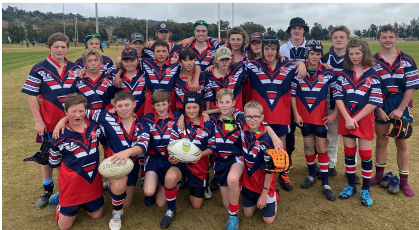
Boys Small Schools Rugby League Under 14's team