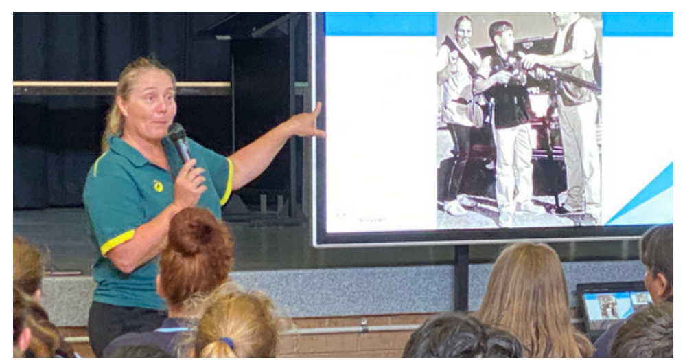
Suzy Balogh - Dual Olympian and Olympic Gold Medallist