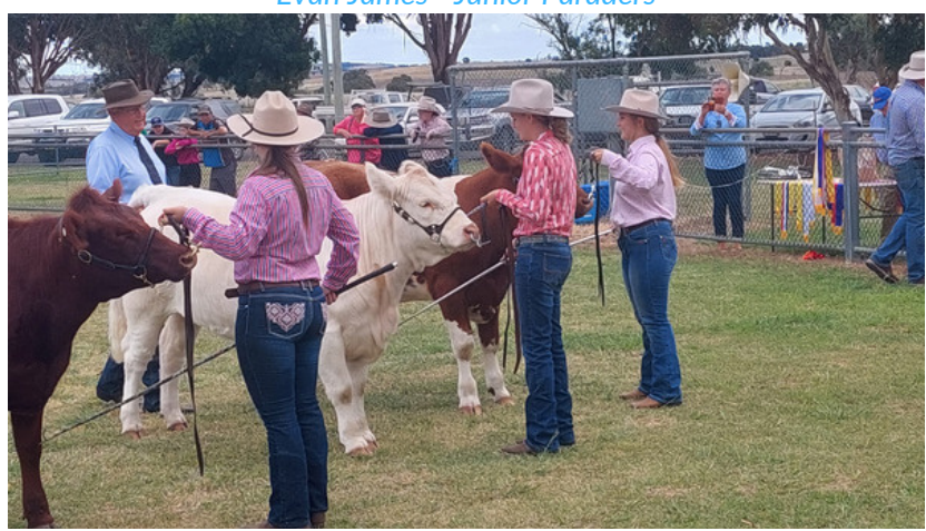
Action Shot of Senior Girls Parading