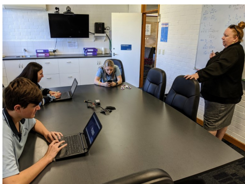
Year 12 Standard Maths trialling video conferencing using different devices.

Year 12 Standard Maths are currently preparing for their upcoming mid-course exams. This semester they have been looking at Financial Maths - Investments, Credit Cards, depreciation as well as Measurement - Rates and Ratio applications and Non-right angle Trigonometry. They have been undertaking assessments for learning that involved looking at the affordability of a mortgage and the design, construction and running costing and sustainability of a small teenager retreat. All assessments encourage students to look at real life applications of mathematics.