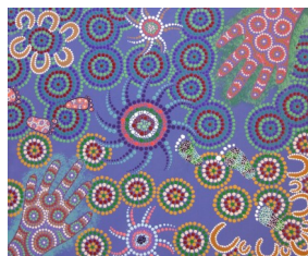
ART WORK BY NATALIE WILLIAMS

COMMISSIONED FOR THE MLHD WOMEN'S NURSES