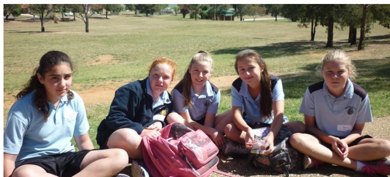
Year 7 2015 students enjoyed their first orientation day today

The student leaders will be formally inducted early next year.